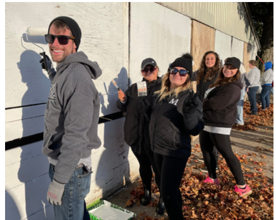
Michigan One employees painting the Livestock Barn at the Ionia Fairgrounds